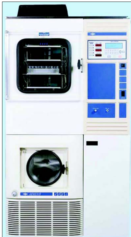
Figure 1. A Typical research lyophilizer.

phases of the lyophilization cycle must take place in a vacuum in order to effect the sublimation and desorption of water or other solvent out of the product. In turn, because the lyophilization process occurs in an evacuated vessel, both designers and users of lyophilizers are presented with unique challenges in maintaining the sterility of the product in a vacuum. Among these challenges are the measurement of system “tightness” and the establishment of an inleakage criterion that maintains a reasonable assurance of product sterility. With this in mind, the Vacuum Integrity Test is an important part of any Factory Acceptance Test (FAT), Site Acceptance Test (SAT), and/or Operation Qualification (OQ).